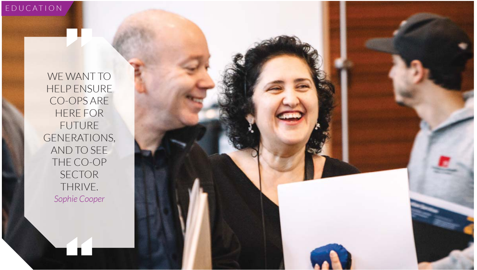
CHF BC members learn together at an education event.