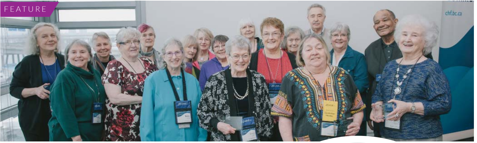
A group of the first Century of Co-op Award winners at the award ceremony on March 24, 2017.