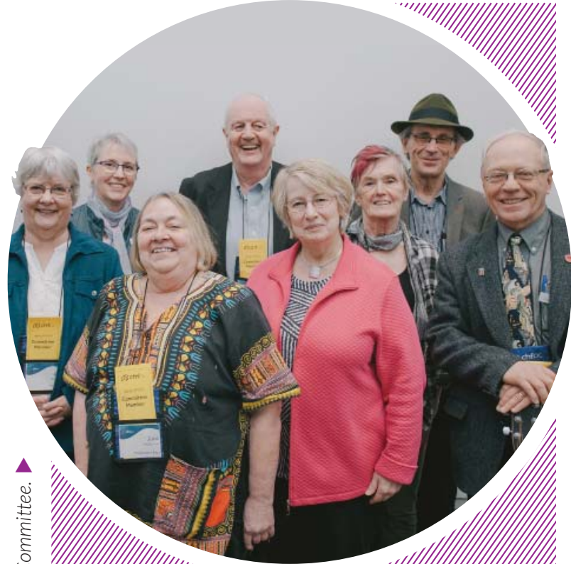
CHF BC's Aging in Place Committee.

Award winners who couldn't attend the March 24 event received their awards separately. Deadline to nominate a member for next year's award is August 31, 2017.