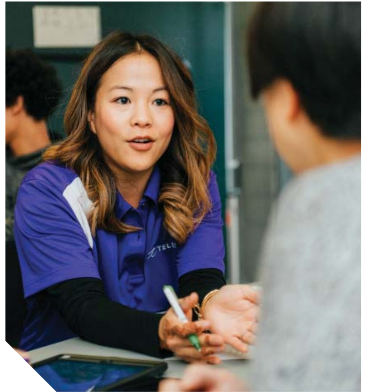
Co-op members learn more about the program and sign-up at Delta Green Co-op.

Visit cotel.ca to learn more and deals for referrals too!