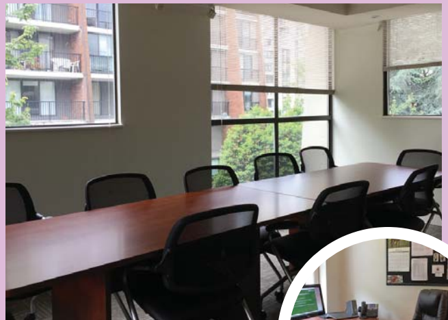
CHF BC's new Island office is at 301 - 821 Burdett Avenue, Victoria